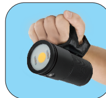
Goodman glove for hands-free operation