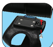
Fix the glove on the light with the supplied screw