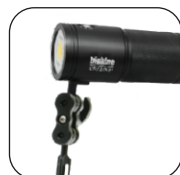
*Photographic Arms and Clips are sold separately