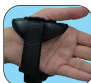
Tighten by pulling the velcro