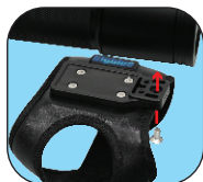
Fix the glove on the light with the supplied screw