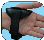
Tighten by pulling the velcro